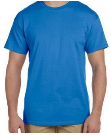
Men's example for Barn Hunt

Our agility t-shirts are made of 100% pre-shrunk cotton in a 5.3 ounce weight in lime. They will be in men's or women's sizes with short sleeves and an agility design screen printed on the front. The Barn Hunt t-shirts will have a Barn Hunt design screen printed on a 6.1 ounce pre shrunk cotton short sleeved shirt in the Iris color with both men and women sizes.