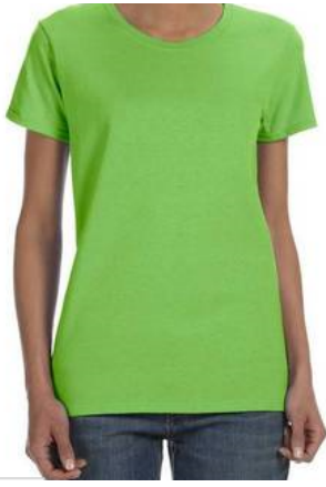
Women's example for Agility

Our agility t-shirts are made of 100% pre-shrunk cotton in a 5.3 ounce weight in lime. They will be in men's or women's sizes with short sleeves and an agility design screen printed on the front. The Barn Hunt t-shirts will have a Barn Hunt design screen printed on a 6.1 ounce pre shrunk cotton short sleeved shirt in the Iris color with both men and women sizes.