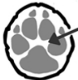
Illustration by Catherine McMillan

Remove hair from between pads with #30 or scissors.