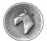
Illustration by Catherine McMillan