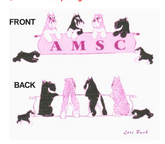
Make checks payable to AMSC