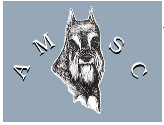
new logo on floor mats and vests

also White Polo Shirts with same logo Unisex sizes S-XXL $35 includes shipping