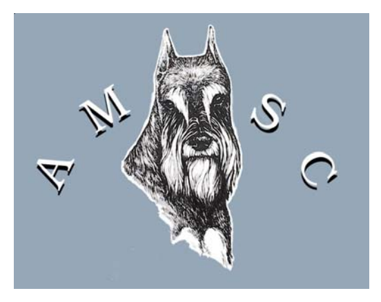
new logo on floor mats and vests