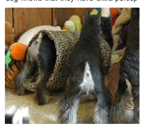
"Quick...into the tunnel...a storm is comina!"

While it's fascinating to think our canine friends could have telepathic powers, science can find no evidence to prove that. But anyone who has spent time with a dog knows that they have extra-percep-