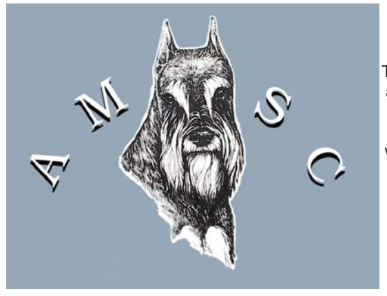
new logo on floor mats and vests

also White Polo Shirts with same logo Unisex sizes S-XXL $35 includes shipping