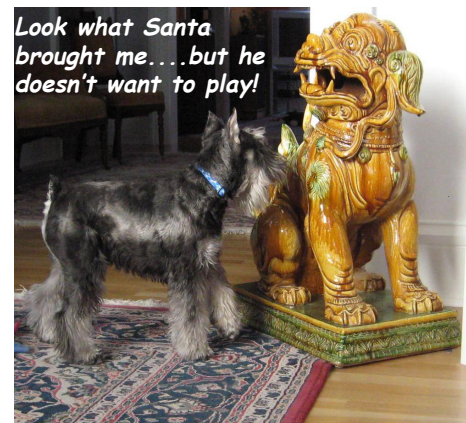
Look what Santa brought me...but he doesn't want to play!

PLEASE PAY YOUR DUES ON TIME .... AND UPDATE YOUR DATA