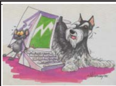
How to Access the MEMBERS ONLY section of the AMSC website

Click the Members tab in the top right hand section of the website