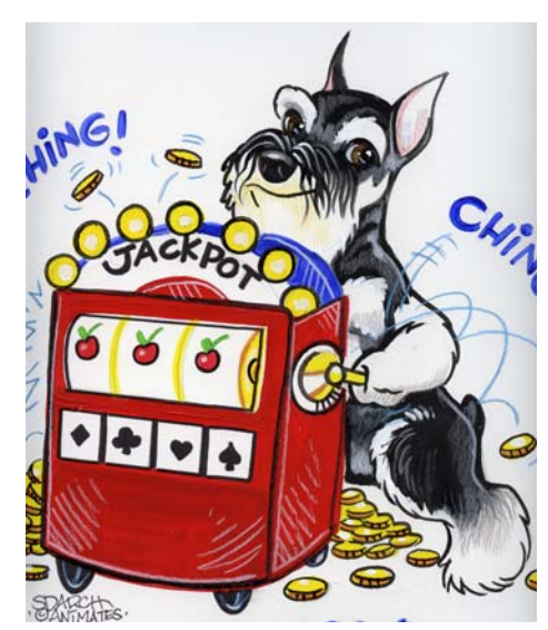
Hurray! I'm a winner!

If you decide to spay your dog, holding off on the surgery until she is sexually mature and fully mentally and physically developed can help protect her against many forms of cancers and endocrine diseases later on.