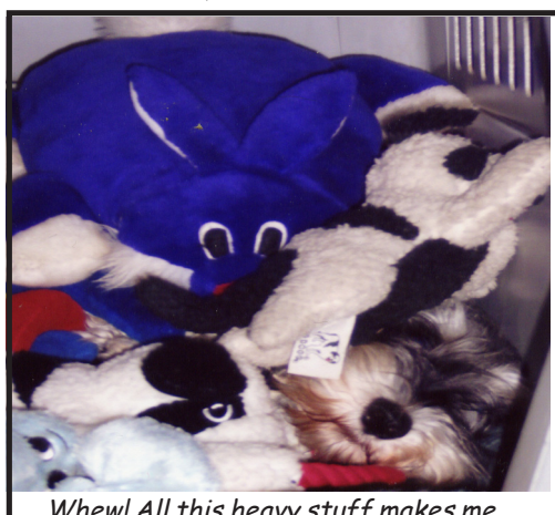
Whew! All this heavy stuff makes me wanna hide!