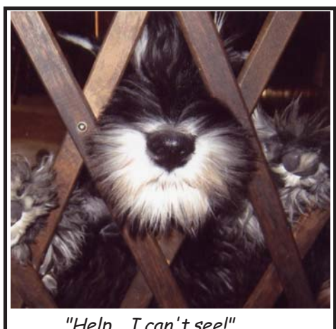
"Help....I can't see!"

For the most part the haw is not visible in canines, with the exception of St. Bernards and Basset Hounds. The haw may appear noticeable because it is red and inflamed due to infection or displacement. This is more common in the first year of a canine's life and more prone to certain breeds including beagles, cocker spaniels and boxers. If you do notice discoloration and swelling in the corner of your pet's eye be sure to contact your vet. A protruding haw is a problem that can usually be corrected with very minor surgery.