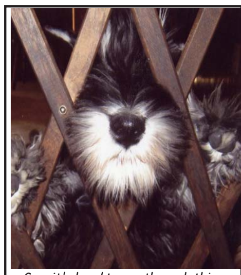
Gee, it's hard to see through this gate!