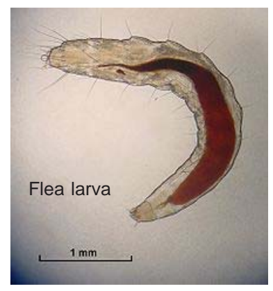
Stage 2 – The Household Environment You cannot rid your companion of fleas by treating him or her alone, (unless you are willing to resort to pesticides). Most of the population lives and develops in your house and yard, not on your pet. Treating the environment is essential if you want to win this war.

Fleas will develop immunity to any pesticide over time. This is already being seen with some of the spot-on products. They cannot, however, develop immunity to dehydration – which is how the diatomaceous earth and boric acid products kill fleas.