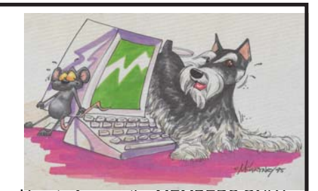
How to Access the MEMBERS ONLY section of the AMSC website

Genetics is the study of traits that can be inherited. Genetics is not an easy topic to learn. Starting out with terms and their