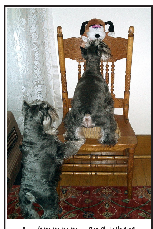
"....hmmmm...and where did you come from?"