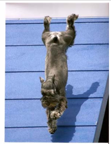
head over heels for agility!