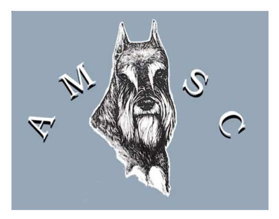
new logo on floor mats and vests