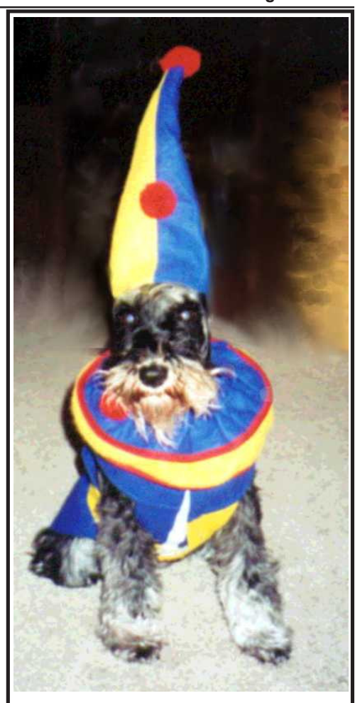
Darn! I feel like a clown! Why do they do this to me every Halloween?

Breeders should plan their matings based on selecting toward a breed standard, based on the ideal temperament, performance, and conformation, and should select against the significant breed related health issues. Using progeny and sib-based information to select for desirable traits, and against detrimental traits will allow greater control.