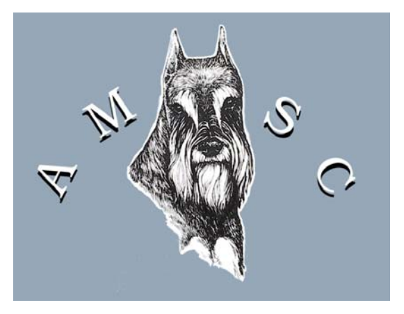
new logo on floor mats and vests

White Polo Shirts with same logo Unisex sizes S-XXL $35 includes shipping