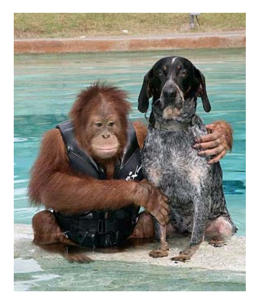
I'm a great dog sitter!

No matter how much confidence you have in them you will probably want to check in frequently.