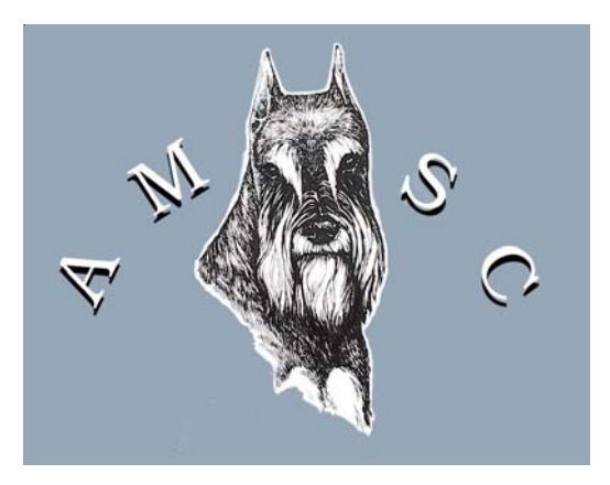
new logo on floor mats and vests