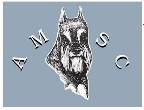
new logo on floor mats and vests

also White Polo Shirts with same logo Unisex sizes S-XXL $35 includes shipping