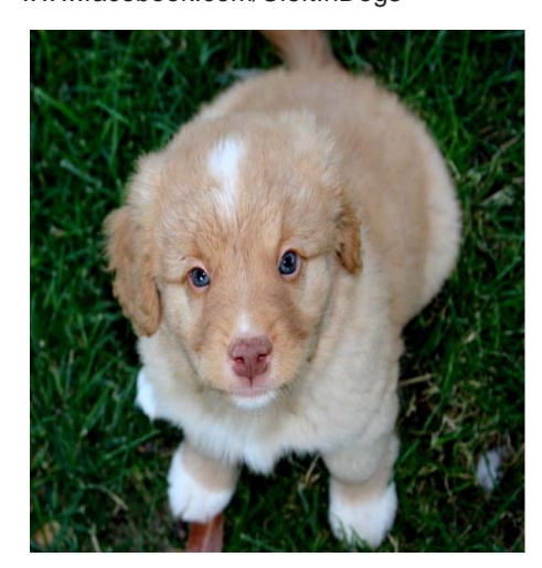
Please help us in preventing these birth defects!

For more information, sample collection, and shipping instructions please contact Zena Wolf at <a href="mailto:ztwolf@ucdavis.edu">ztwolf@ucdavis.edu</a>. Follow us on our facebook page at: https://www.facebook.com/CleftInDogs